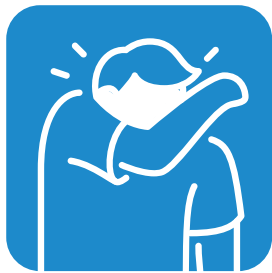
In die Armbeuge niesen